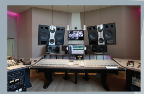
louse of Glass - Italy