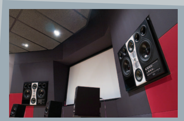
Liberty Studios - Canada