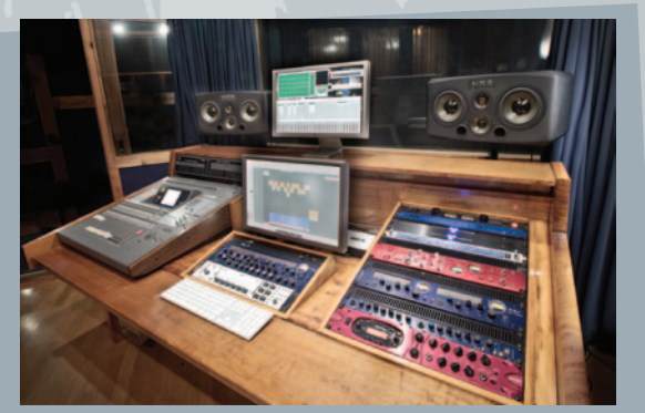
Studio 52 - Australia

Recording and film studios, broadcasting companies and musicians/producers worldwide rely on loudspeakers from ADAM Audio.