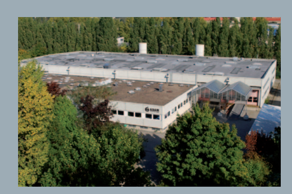
ADAM Audio, Berlin

For further information on ADAM Audio please go to our webpage www.adam-audio.com.