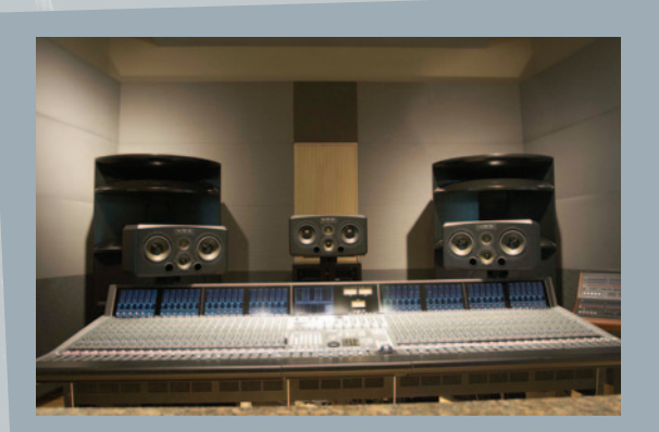
Blade Studios - USA

ADAM Audio is a leading manufacturer of loudspeakers in Pro Audio as well as in the HIFI market. Founded 1999 in Berlin, Germany, the company's loudspeakers have set high standards around the world when it comes to precise monitoring and natural sound reproduction. The widely varied product lineup of the owner-operated company spans from professional studio monitors (SX, AX, and F series), to Multimedia and Home Theater/Installation loudspeakers (ARTist and GTC range) to the highend home entertainment models (Classic and Tensor series). The trademark all ADAM models have in common is the proprietary X-ART tweeter. Handmade in Berlin, Germany, it performs with a nearly flat frequency response reaching up to 50 kHz