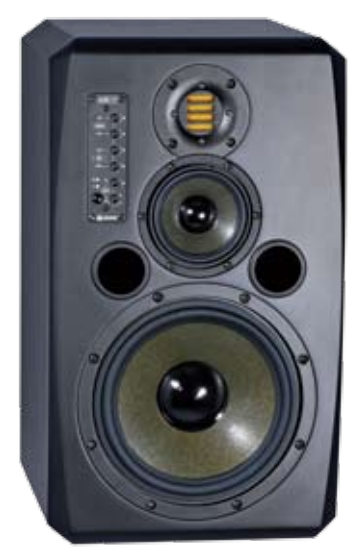
The vertical version - S<sub>3</sub>X-V

that had been tweaked, but a completely different unit.