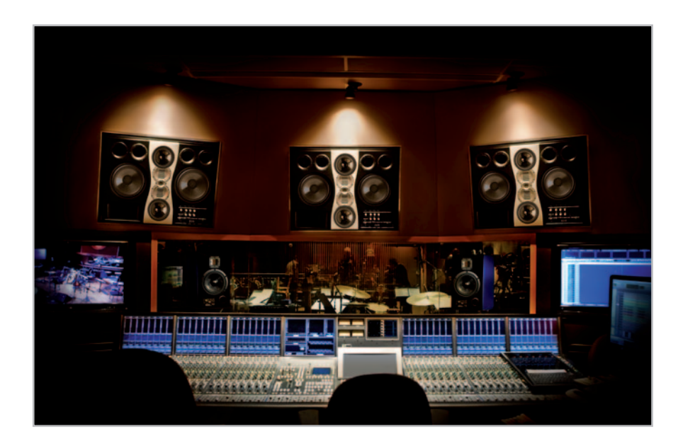
Monitors of ADAM Professional Audio at Radio Canada, Studio 12