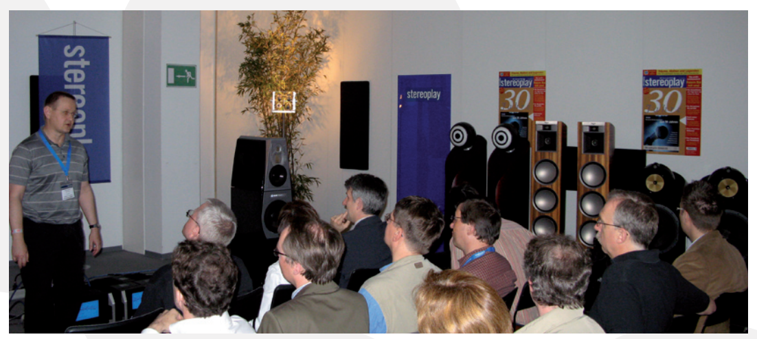
A stereoplay loudspeaker-specialist introduces the TENSOR Beta